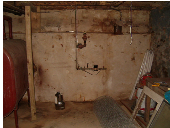
Commercial building basement, two AGI Universal Samplers Suspended, Summa can on floor; heating oil tank and workbench

Amplified Geochemical Imaging, LLC 210 Executive Drive, Suite 1, Newark, DE 19702, USA Phone: +1.302.266.2428, Fax: +1.302.266.2429 E-mail: info@agisurveys.net www.agisurveys.net